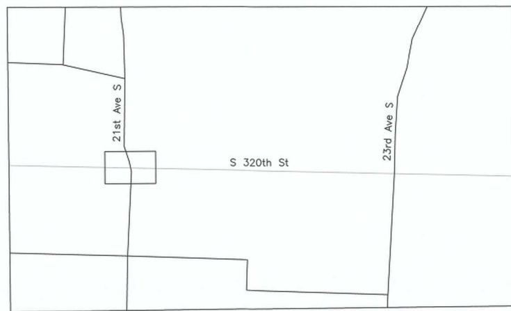
PROJECT LOCATION MAP NO SCALE