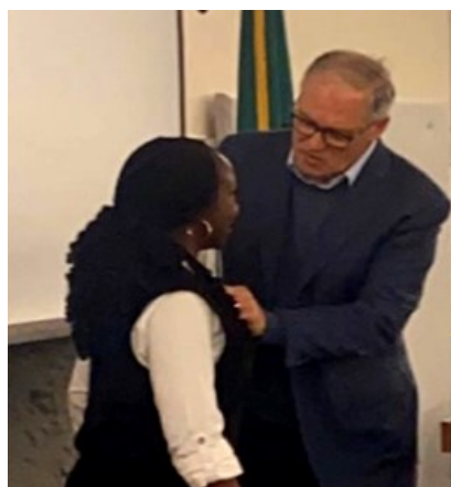
Federal Way High School ASB President being honored as Assistant Governor at the Capitol for Charles Roland African American Legislative Day.

The beauty is that there are many ways to get involved! The Federal Way Public Schools' Mentor & Me program pairs volunteers with students for approximately one hour per week, and through the community closet, Outreach Coordinators have been able to provide thousands of items each month to students, including snacks, take-home food, clothing, and hygiene items.