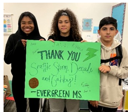
Students at Evergreen Middle School.

To be part of the mission of Communities in Schools, please visit their website at www.federalwayhighline.ciswa.org