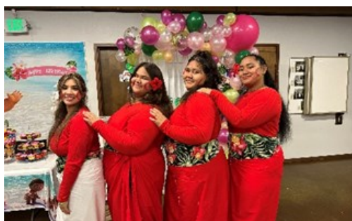
Students at Todd Beamer High School.

The beauty is that there are many ways to get involved! The Federal Way Public Schools' Mentor & Me program pairs volunteers with students for approximately one hour per week, and through the community closet, Outreach Coordinators have been able to provide thousands of items each month to students, including snacks, take-home food, clothing, and hygiene items.