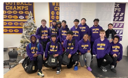
Illahaee Middle School Wrestlers.